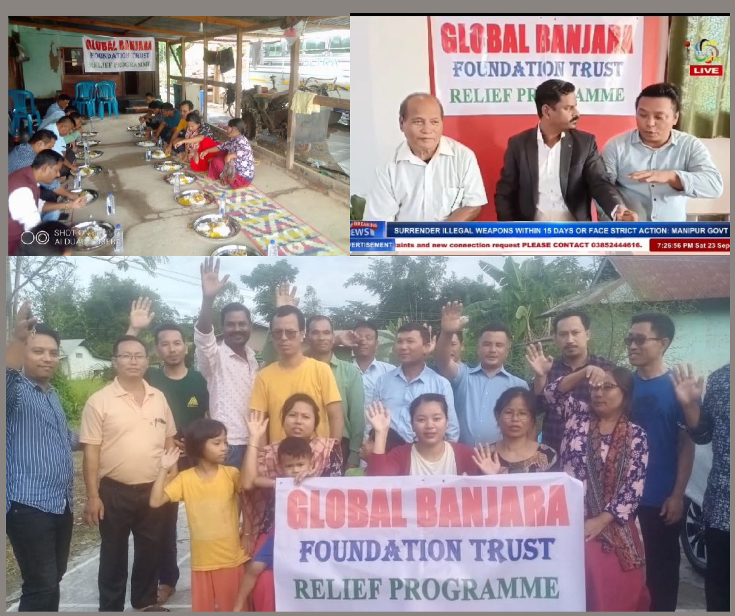
The local news channel mentioned above has covered our relief work in Manipur, India. This time, 120 families have received food packets, and we have also provided financial assistance to a few pastors. Additionally, we have made food available a couple of small campuses.

https://twitter.com/politics 2022 /status/1708158239614136550?s=43&t=DI0jDFZQZSJ2EIANTzeVmw